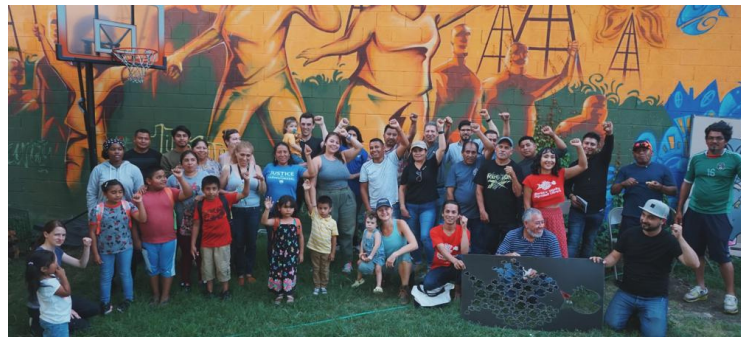
CIW leaders visit Nashville

Families of fallen construction workers and injured construction workers have been leading our health and safety programming in 2022. In the Spring, they organized 2 powerful actions to honor our loved ones who have died while building Nashville in observation of Workers Memorial Week. In the Summer, the health and safety committee helped train 90 construction workers to identify and prevent hazards in the workplace. They also have met with US Secretary of Labor Marty Walsh & Deputy Labor Secretary Julie Sue; and participated in OSHA's Worker Summit in Washington, D.C., to bring forward their demands for safe construction jobs in Nashville.