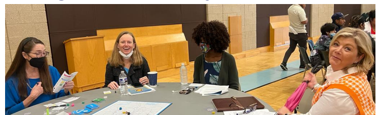
Built on Faith Summit, November 2022

We are continuing to organize alongside working-class tenants. Stay tuned in 2023!